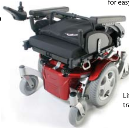
Lift-off backrest for easy transportation and storage