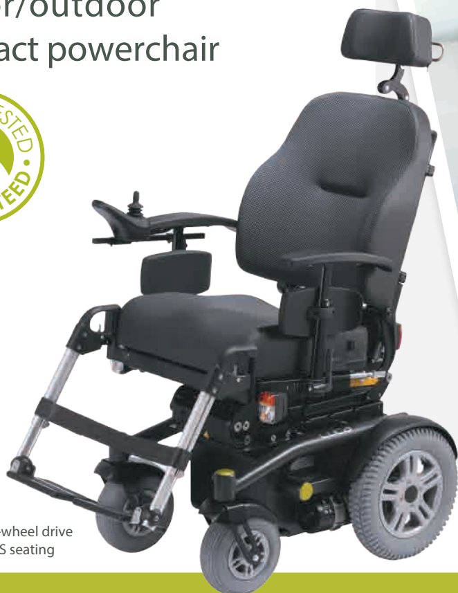
LUCA rear-wheel drive with QCLASS seating