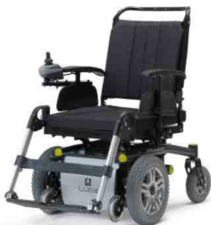
LUCA front-wheel drive with E-QLASS seating